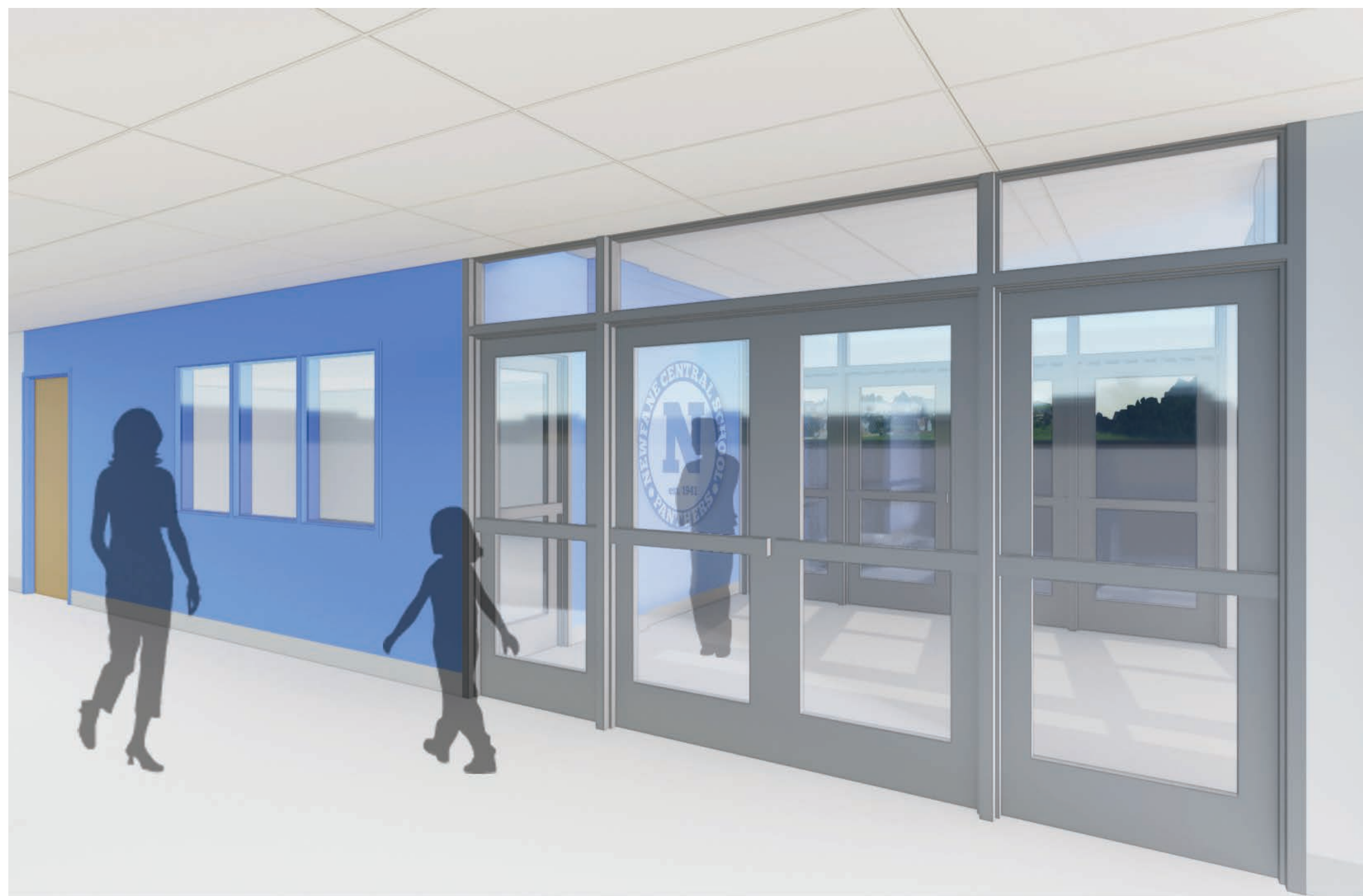
MULTI-LAYERED SECURE BUILDING ENTRANCE

In addition to reconfiguring the main entrance to route all visitors through the Main Office, "hardening" the foyer, and replacing the hardware on all the classroom doors with quick locking mechanisms, Newfane Elementary will see their student restrooms refurbished and brought into compliance with ADA requirements. Completing the roof replacement along with repaving the parking lot, bus loop and upgrading the outdoor lighting will be the other focus areas at the elementary.