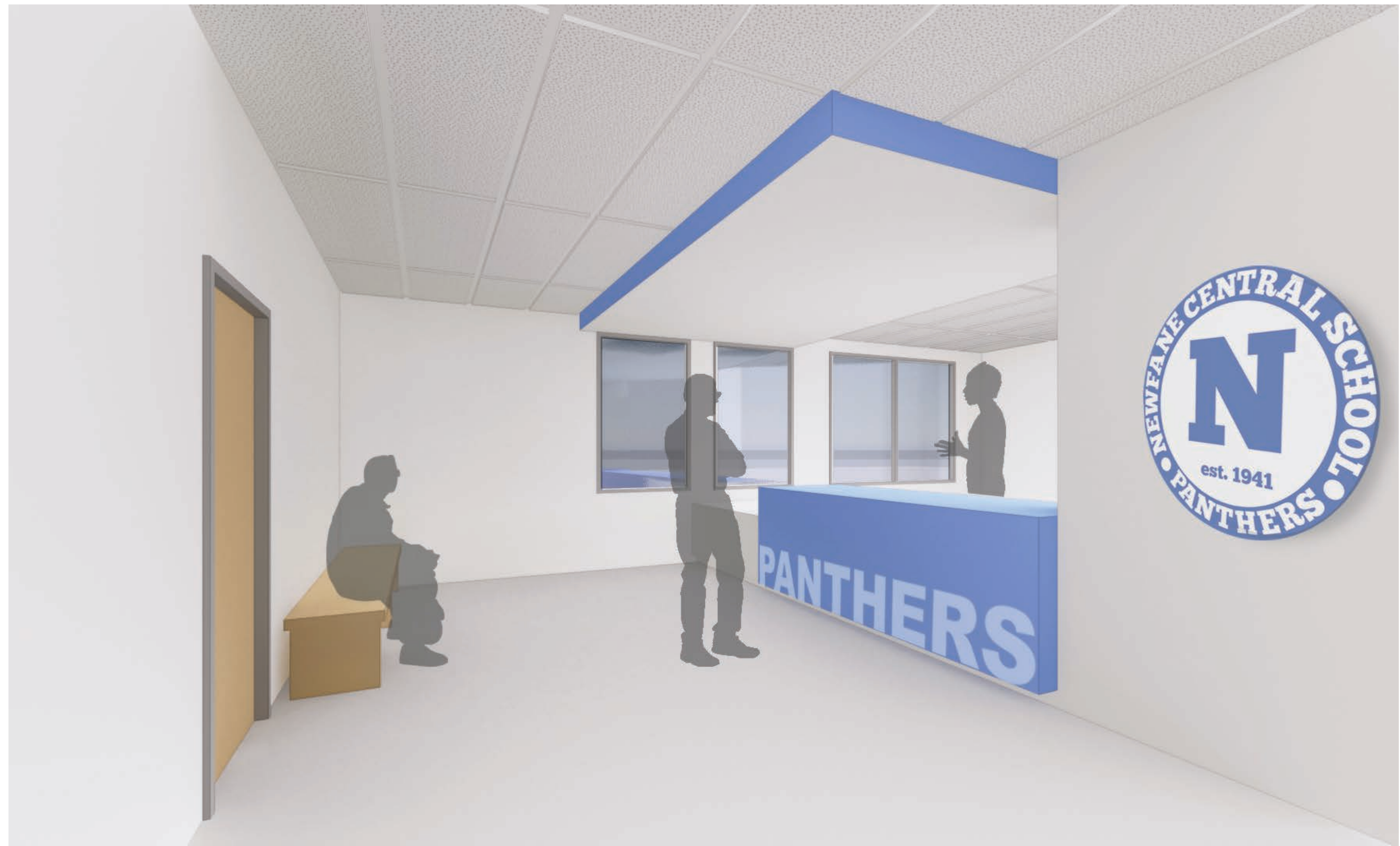
MULTI-LAYERED SECURE BUILDING ENTRANCE AND MAIN OFFICE RECONFIGURATION

In addition to reconfiguring the main entrance to route all visitors through a renovated Main Office, "hardening" the foyer, and replacing the hardware and refurbishing all the classroom doors with quick locking mechanisms, we will be continuing the roof replacement at the Middle School, resurfacing some parking lot areas and driveways and replacing the exterior building doors on the bus circle. Both the boys and the girls locker rooms will get a facelift, as well as the spectator bathrooms near the track. The project also provides funds to convert the current district signboard, generously donated by the PTSA in 1997, to a digital display format. All the work at the middle school will be designed to maintain the historical integrity of the building under the supervision of the NYS Historical Preservation Office.